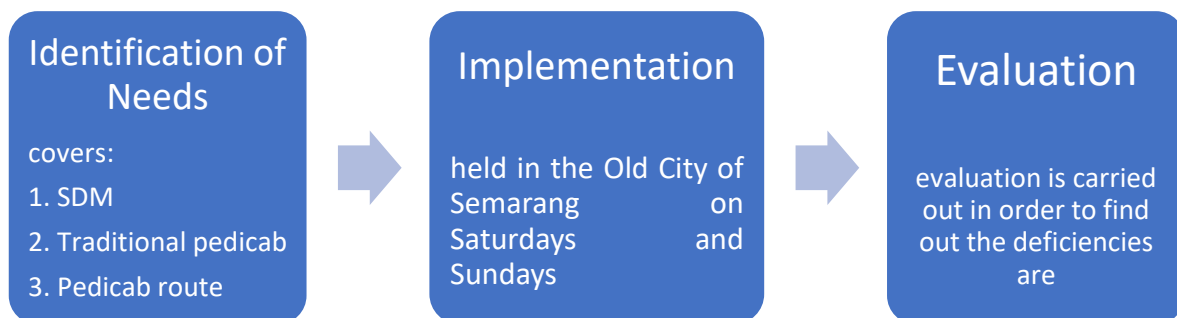
Figure 1. The concept of a tourist pedicab in the city of Semarang

The method used in this task is a qualitative descriptive method using grounded theory of real conditions [9]. The data is collected through the documentation method, the documentation method itself consists of all records or traces that may be related. Implementation held in the Old City of Semarang on Saturdays and Sundays.