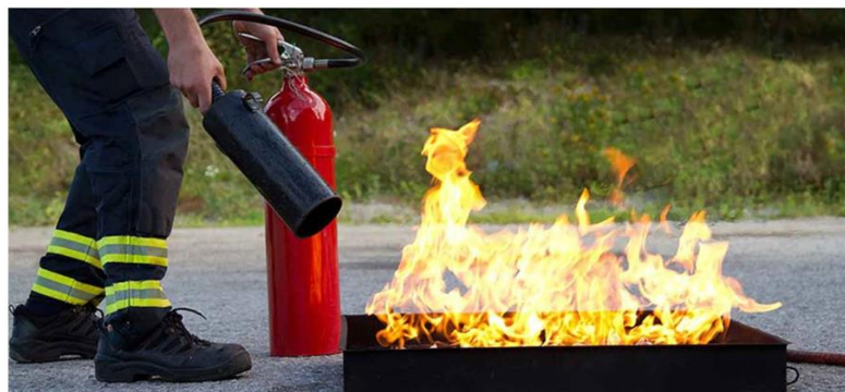
Figure 2. How to use fire extinguishers [21]

In general, the implementation of OHS in the hospitality industry is to prevent any casualties, including disease and death and prevent any potential hazard [18]. Training that can be held in the hospitality industry includes general K3 experts, limited space K3 leading officers, the use of fire extinguishers, the introduction of chemicals, and the use of personal protective equipment. In the hospitality industry, susceptible fire to occur and electrical shorts. Many hospitality industries provide a food service that makes them have a kitchen. A kitchen is a crucial category for a fire [19], but a restaurant is a safe category cause have a small potential to make a fire. Other potential electrical shorts categories include lifts, escalators, engines, etc. In every hospitality industry, there is an emergency response team. Fire emergency teams are usually led by the chief engineer [20]. The implementation of training, of course, requires people who are experts in their fields. These expert perpetrators include people who are OHS certified as general and firefighters. This training in figure 2 is an example of general training practice that is usually given and becomes mandatory knowledge to overcome micro problems.